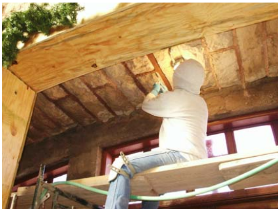
Tommy working on the entryway

Restoration crewmembers Tommy Spottedbird, Arylis Chee and Nikona Hosetosavit have been working diligently and making great progress. In early November the southwest alcove stonework restoration work was completed. That means three alcoves completed, three to go. This alcove served as a good area to instruct new trainees, as well as an easy place for our occasional volunteers to lend a hand.