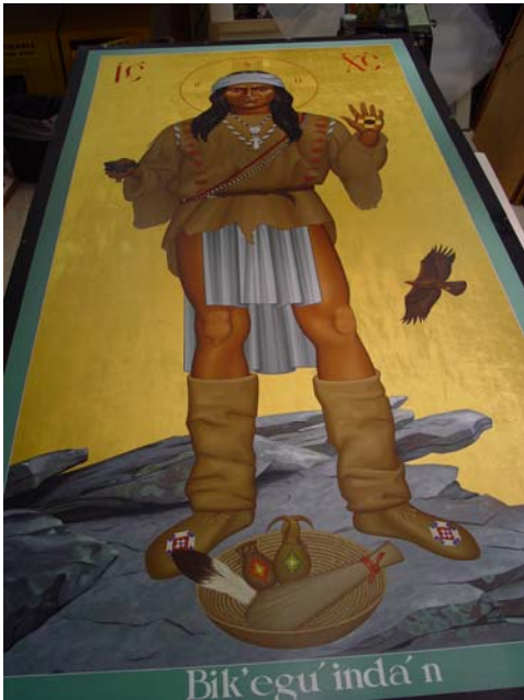
The Apache Christ in conservation lab at NMSU, Las Cruces.