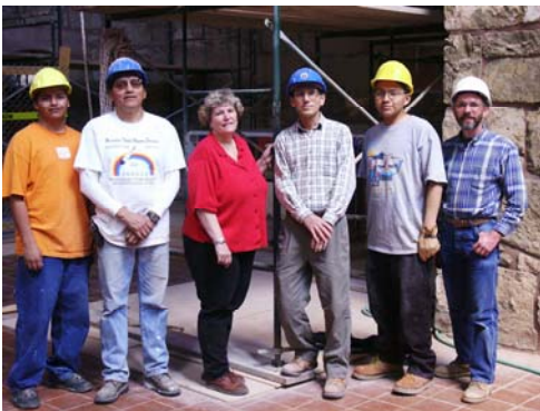
Spring 2003 Restoration Crew