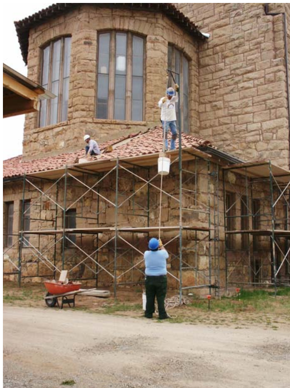
The crew removing roof tile in preparation for summer work on the apse exterior.