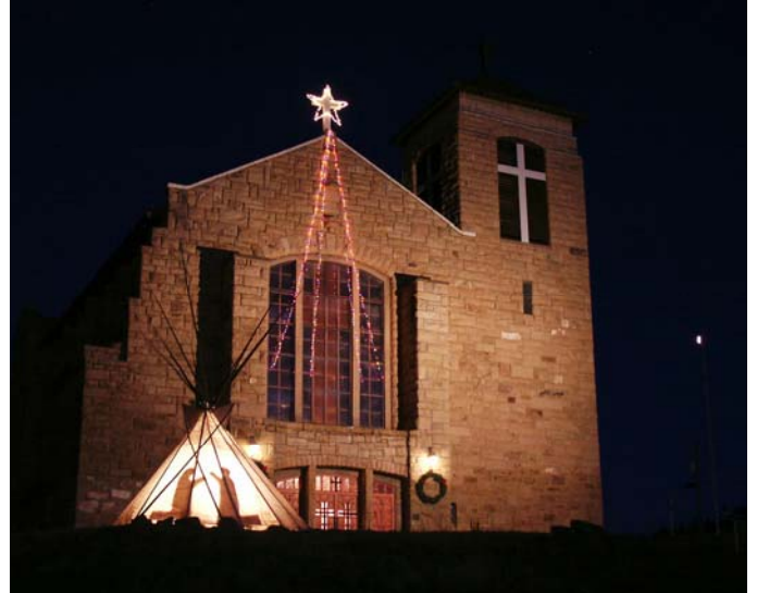
Nighttime view seen from Highway 70