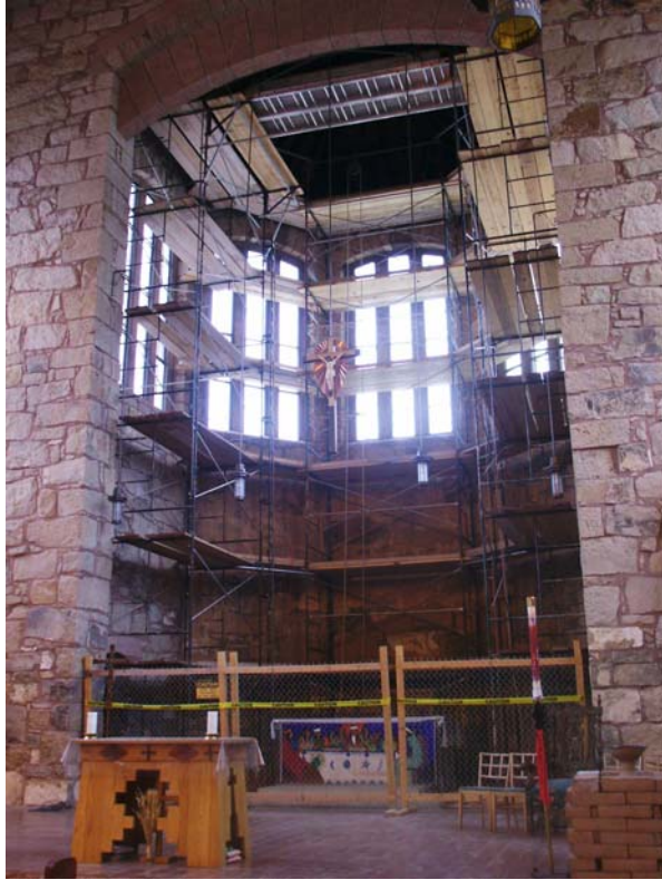
Scaffolding in the apse of the church