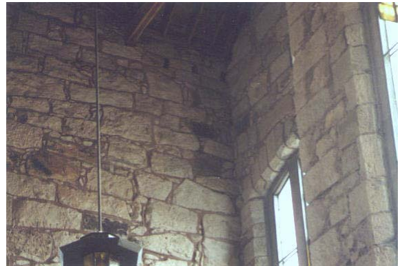
South transept before and after.