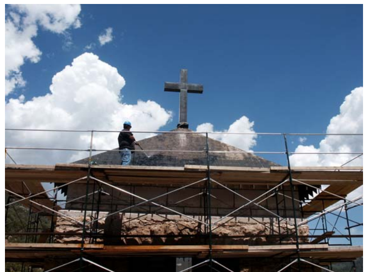
Arylis Chee and Lyle Magoosh helping Tommy Spottedbird remove the old tiles from the main roof.