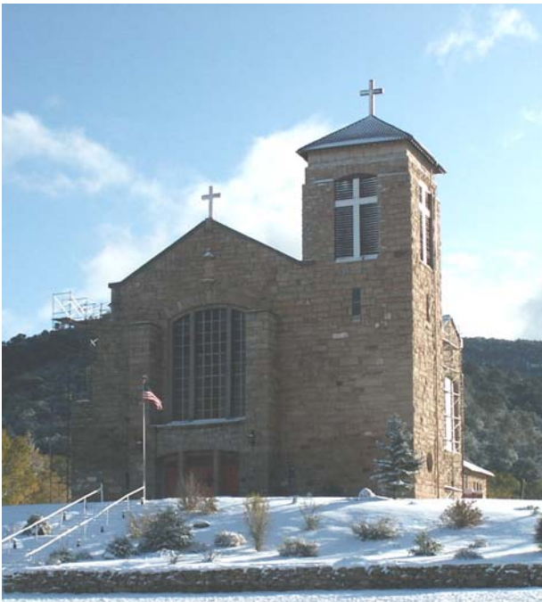
While a winter storm brought the work to a standstill for over a week.