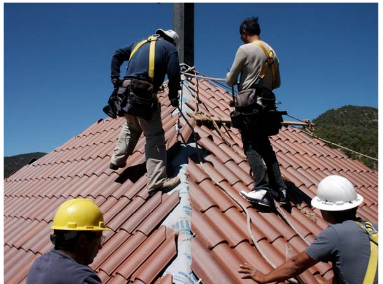
Roof Crew getting ready to do the tile hips.