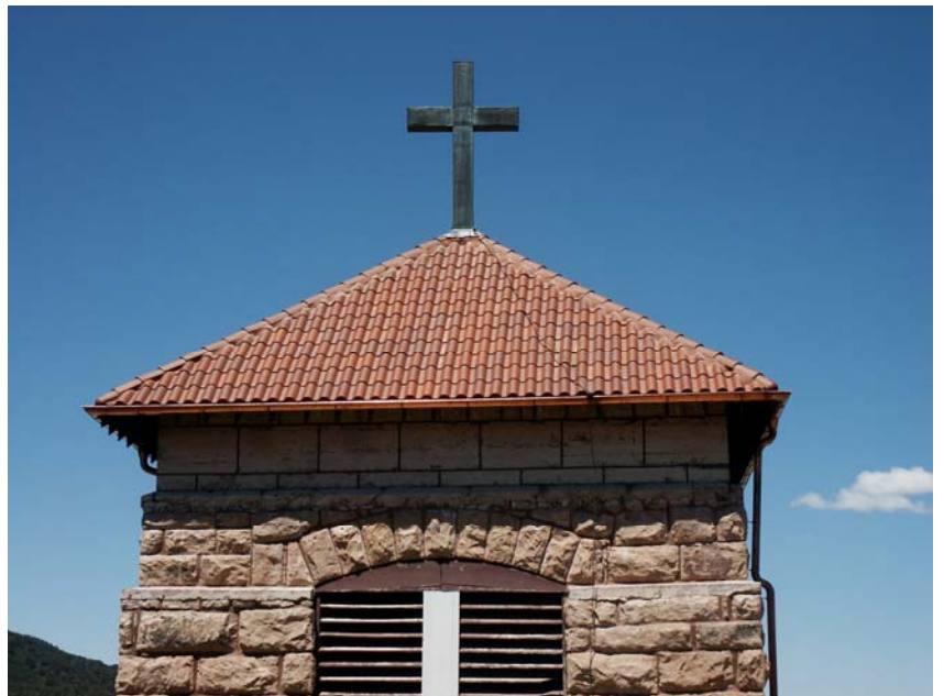
The Finished Bell tower Roof. Complete with copper gutters and downspout.