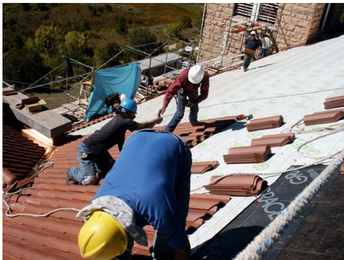
Roofing crew making progress