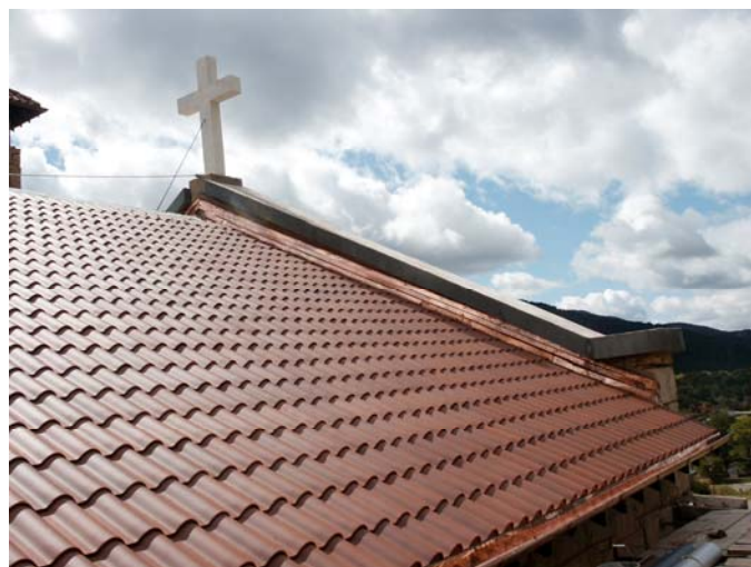
And the roof is just beautiful

With the onset of winter and the main roof fin-