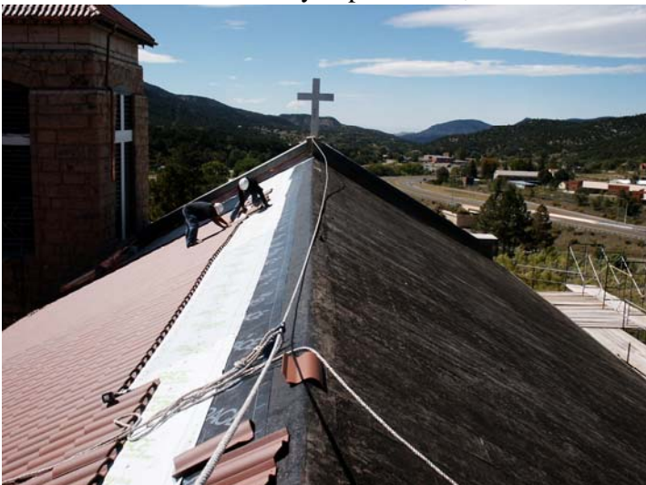
Andres Ramirez & Sam Sosa placing tile

Each day on the roof brought with it something new, we experienced everything from blood, sweat and tears to laughter and triumphant elation when things finally came together perfectly. There were so many roadblocks along the way from wrong items delivered to nothing being square or level and there are no 90° angles anywhere on the roof. Much of the work was tedious, templates had to be made for copper fabrications of the pans and flashings. Kerfs had to be cut into the stone and mortar added to give the copper a more even place to adhere to. We added three experienced roofers to the crew for the duration. Tobias Montoya, Andres Ramirez and Samuel Sosa were a welcome addition to our crew of Co-Director/Foreman Tommy Spottedbird, Martin Pizarro,