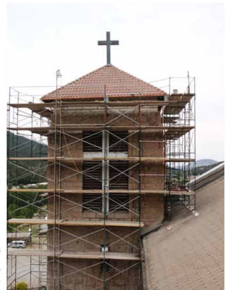
The finished Bell Tower

downspout on the bell tower took eight and one half working days. The work to prepare the roof from putting up scaffolding, taking off the old tiles, power washing, replacing damaged wood,