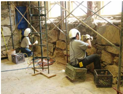
Removing deteriorated mortar