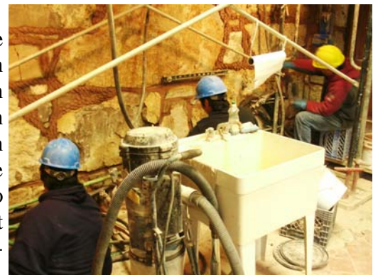
Repointing the stonework with lime mortar