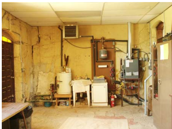
Sacristy west wall