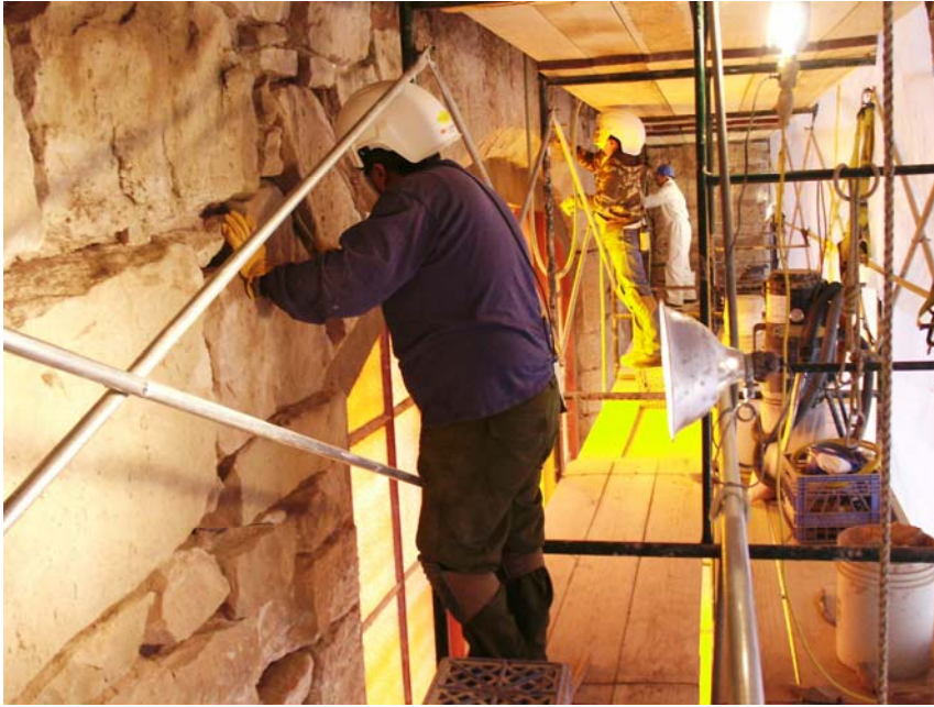
Arylis, Tommy, and Brother David working on the interior west wall.

Last fall the scaffolding was set up on the interior of the west wall. This winter (and next) the crew is involved in repointing the stonework, reinforcing the roof beams, and eventually replacing the badly damaged colored Plexiglas window panels. The crew has made good progress repointing the mortar, which proved to be quite weak. Many passageways for bats and cold air have been plugged up as the stone