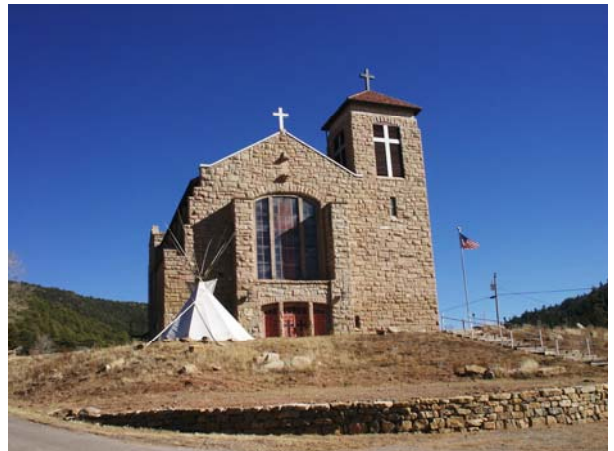
St Joseph Apache Mission

Currently we are working with the New Mexico Office of Historic Preservation on our application to be placed on the National Registry of Historic Places. This recognition will further acknowledge the uniqueness and importance of this landmark church and veteran’s memorial. If accepted we will qualify to compete for funding opportunities through government grants like “Save America’s Treasures”.