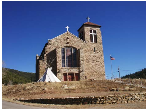
St Joseph Apache Mission

Currently we are working with the New Mexico Office of Historic Preservation on our application to be placed on the National Registry of Historic Places. This recognition will further acknowledge the uniqueness and importance of this landmark church and veteran’s memorial. If accepted we will qualify to compete for funding opportunities through government grants like “Save America’s Treasures”.