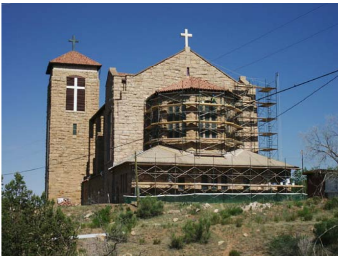
Summer 2004 work on apse exterior