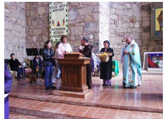
Raffle Drawing October 3, 2004

The raffle generated $9,515.00, 40% of that came as extra donations that were sent in along with the tickets. Many thanks to all who participated in the raffle, made donations, or helped in any way.