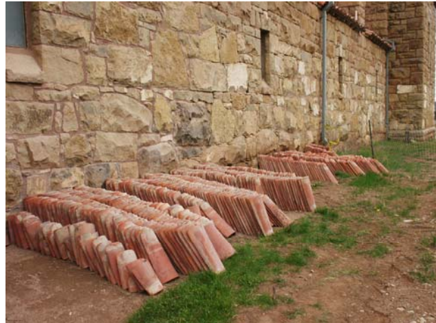
Tile stacked and ready to sell; this is your chance to support the restoration while owning a piece of the Mission.

We are hoping to sell the original tile to help pay for the new roof, so if you know of anyone who would like to purchase one or more vintage La Luz tiles, please contact our office. We will enlist the aid of local artists to paint images on some of these tiles, turning them into little works of art for sale. If you are interested in making a donation to be used to purchase the new roofing material you can send it with a notation that your donation be used for the roof. Thanks!