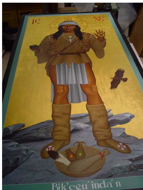
The Apache Christ in conservation lab at NMSU, Las Cruces.