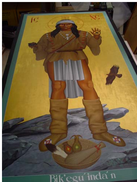
The Apache Christ in conservation lab at NMSU, Las Cruces.