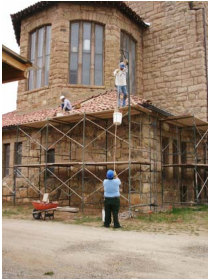
Tommy and Brother Peter removing clay tile while Arylis hoists the tile down in buckets.

Now that winter has finally given way to spring, the crew is busy preparing the roof behind the apse to support the scaffolding that will provide access to one of the work areas for the summer months.